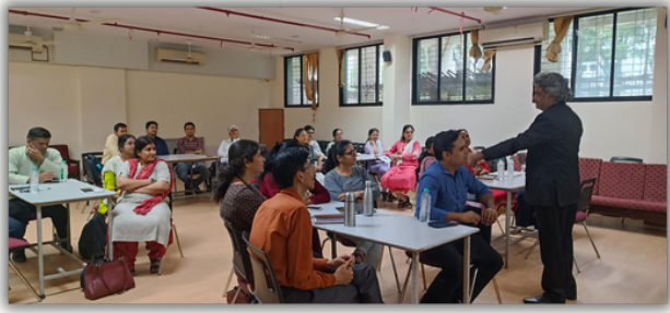
FDP on Design Thinking