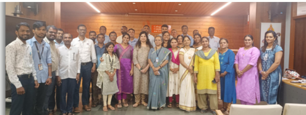
Workshop on Workplace Etiquette (non-teaching staff)

SISSLLD is the newest entry in the family of SIES educational ventures having been launched in November 2022. The earlier central training department of SIES is merged with SISSLLD. It is an institute that strives to enhance skills to foster a world-class learning environment for all teachers, students and administrative staff in order to develop their future competencies.