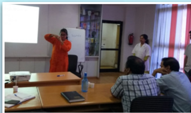
Interactive workshop on Vision, Mission and My Role