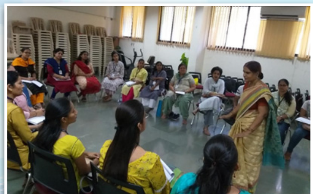
Happiness Workshop for Teaching Staff