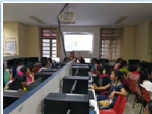
How to Make Power Point Presentation for Effective Teaching Learning Process