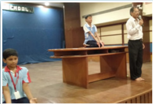
SIES High School