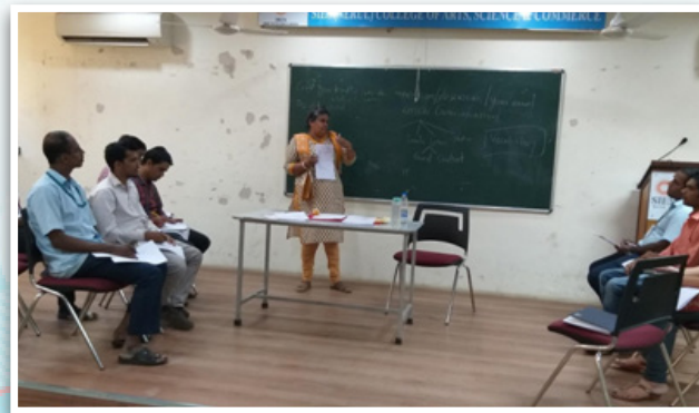
Workshop on Effective Written Communication for Non-teaching staff