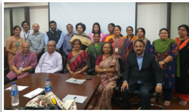
Discussion on Draft National Policy attend by Heads of Institution