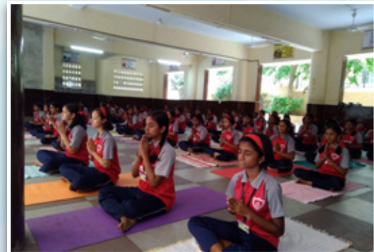
SIES APJ High School