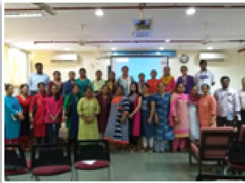
Training on NET / SET Preparation for Teaching Staff